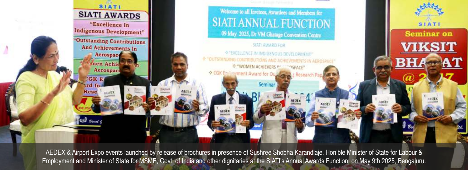
AEDEX & Airport Expo events launched by release of brochures in presence of Sushree Shobha Karandlaje, Hon'ble Minister of State for Labour & Employment and Minister of State for MSME, Govt. of India and other dignitaries at the SIATI's Annual Awards Function, on May 9th 2025, Bengaluru.